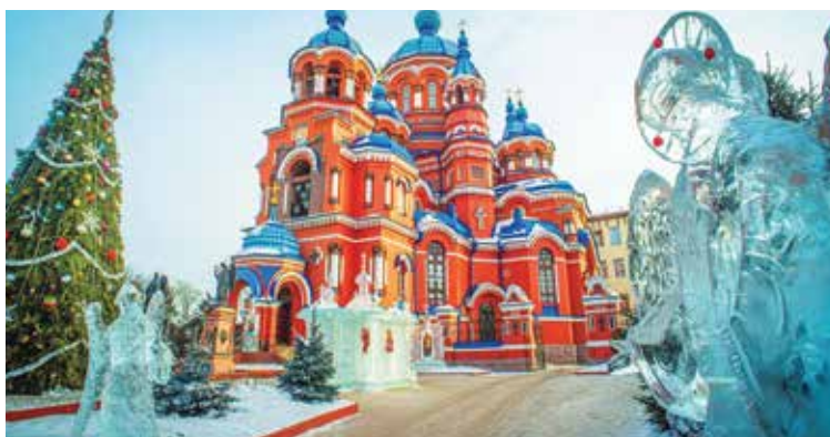
KAZAN CHURCH 喀山圣母教堂