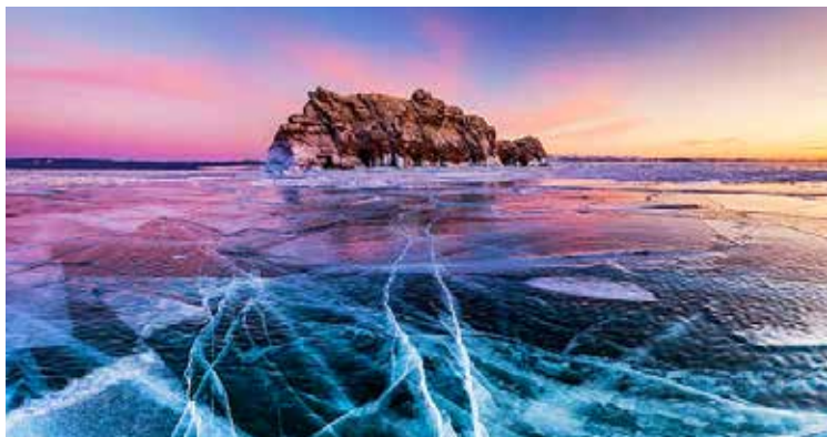
OLKHON ISLAND 奥尔洪岛