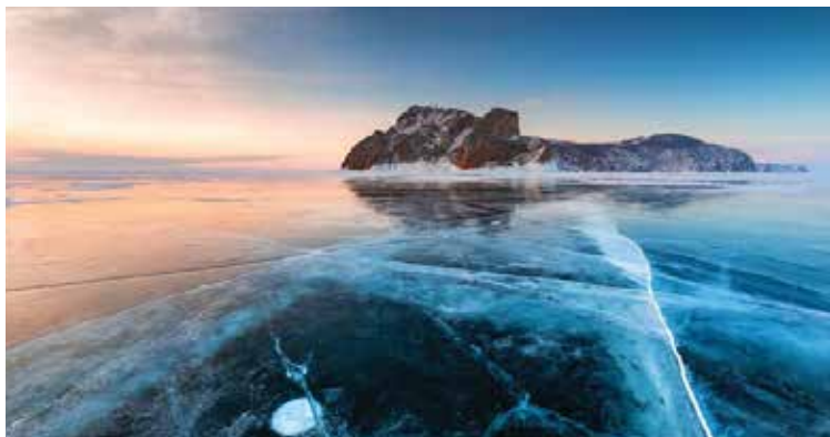
CAPE KHOBOY 科博伊角