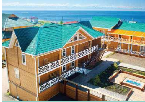
Krestovaya Pad in Listvyanka