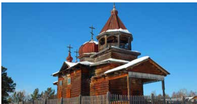
TALTSY MUSEUM 塔尔茨博物馆