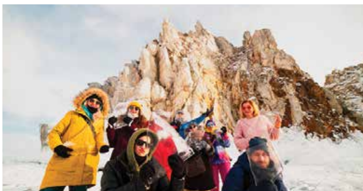
SHAMANKA ROCK 萨满岩