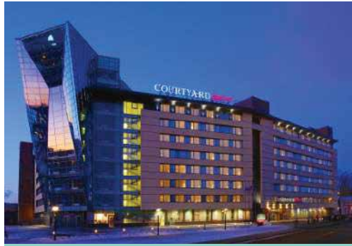
Irkutsk City Center Hotel