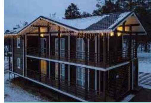
Baikal Wood Eco lodge