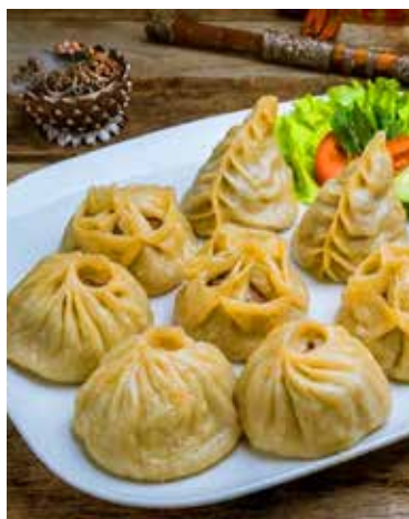
BURYAT DISH - BUUZ 布里亚特菜 - 布兹